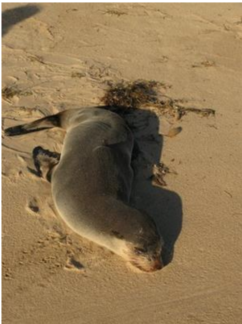
Figure 2: Injured wildlife discovered by PBVR and reported to DPAW.

There was some concern among councillors, staff and residents with starting a volunteer ranger program. To some, 'volunteer rangers' were envisaged as a bunch of vigilantes running around handing out fines and taking the law into their own hands. Others were worried that volunteers could be put in danger if members of the public became aggressive. The Shire was obviously concerned about a wide range of liability and occupational health and safety issues also. However by ensuring that the primary role of the group was to educate rather than enforce, a 12 month trial was approved by council. The trial was a success and the group was formalised with further Shire support including the development of a Volunteer Ranger Policy and training program, purchase of a second hand 4wd vehicle for patrols and a volunteer's uniform. The initial setup of this program cost less than $5000.