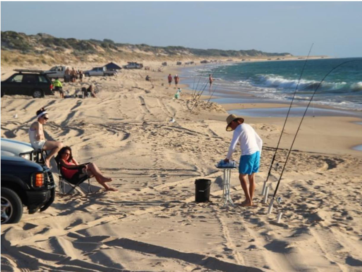
Figure 5: Vehicle numbers in the coastal zone are increasing rapidly

Unfortunately, this doesn't mean that the problem has gone away and once again it is shifting. "With the word out that you can't take your ORV and 'cut up' around Preston Beach without getting busted, the northern and southern adjoining local government areas are seeing increasing damage to the dunes from off road vehicles" said Noel. The number of 4WD users is also rising, Noel and other volunteers counted 180 vehicles on the beach over four hours during a recent summer holiday period and estimate up to an eighty percent increase in numbers overall.