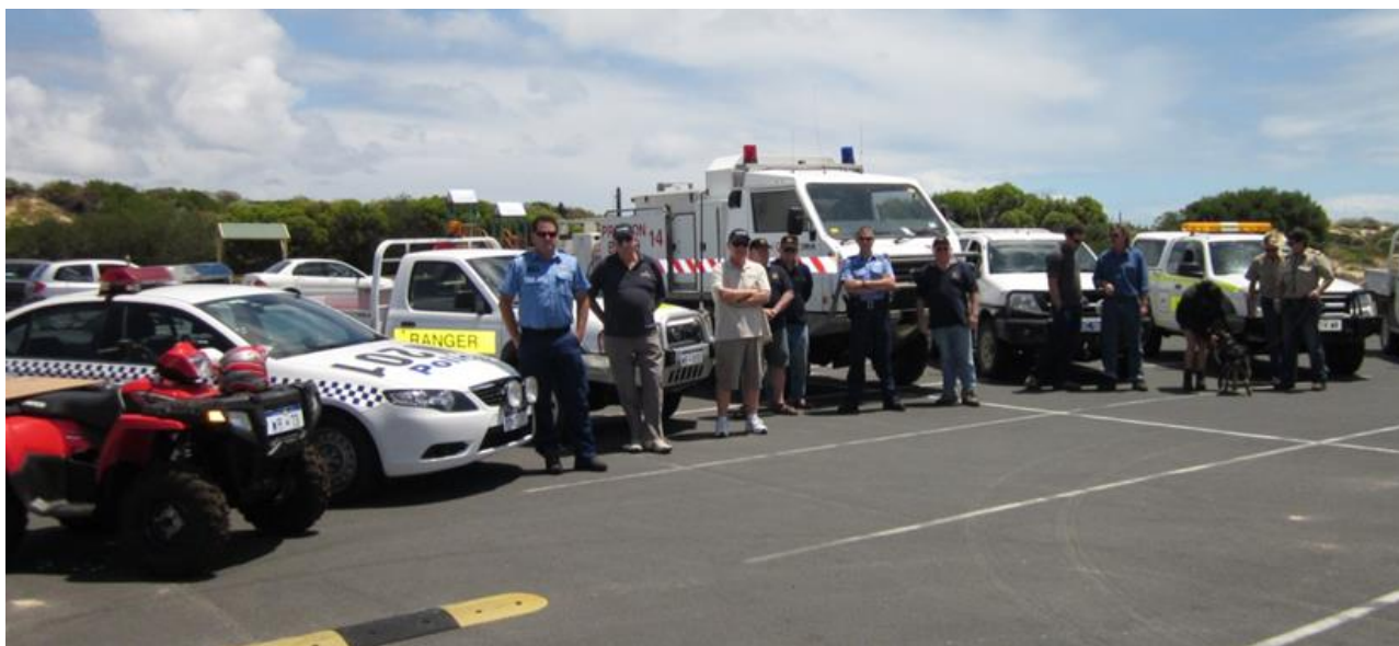
Figure 3: Attendees and vehicles during the annual coastal managers meeting.

The Preston Beach Volunteer Rangers also carry out a broad range of other activities which include supporting and assisting emergency services, wildlife rescues and coastal rehabilitation projects. The group hosts an annual meeting before the peak Christmas holiday period with Shire, Parks and Wildlife, Police, Fisheries and Fire departments to assist in coordinating management actions which minimise and prevent emergencies and illegal activities occurring in the coastal area.